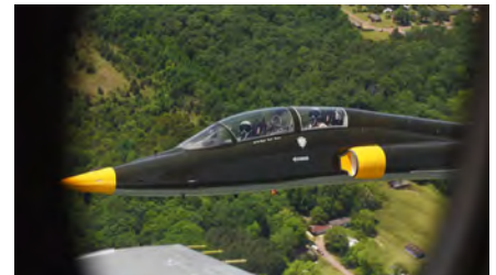
The 14 th Flying Training Wing at Columbus AFB is focused on training world class pilots and providing specialized training in the T-6 Texan II (top), T-38C Talon (bottom), and T-1A Jayhawk aircraft.